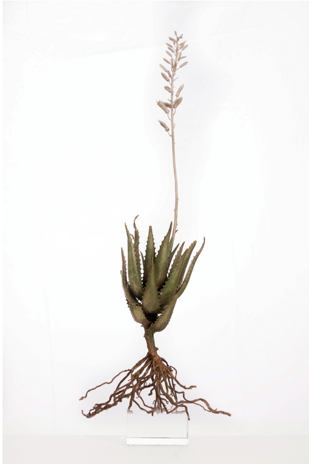
NIC BLADEN Aloe Andongensis bronze on crystal base 51 x 20 x 20 cm