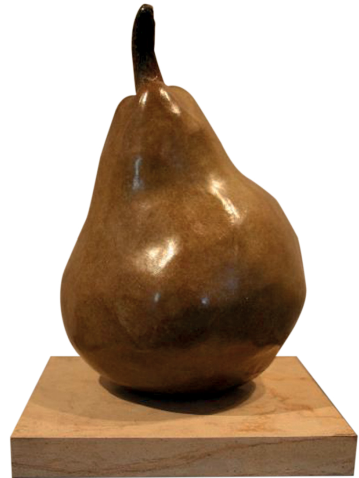
VELAPHI MZIMBA Big Pear Ed. 2/9 bronze 33 x 19.5 x 19.5 cm