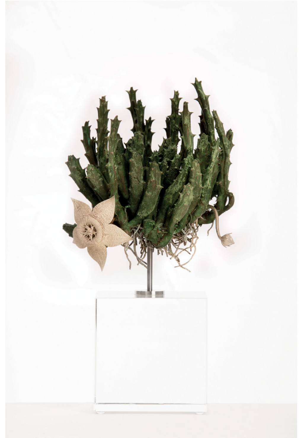
NIC BLADEN Orbea Variegata l. bronze on crystal base 14 x 14 x 10 cm