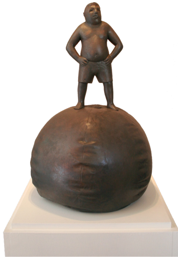
FLORIAN WOZNIAK Global Tourist Ed. 1/8 bronze 56 x 40 x 40 cm