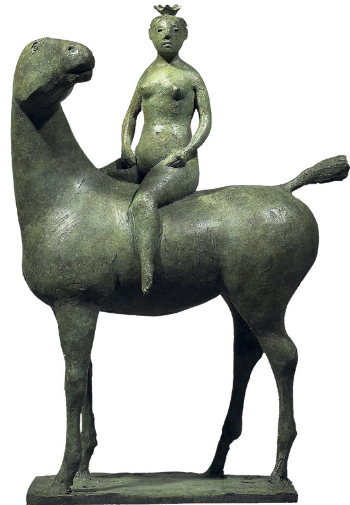
OLIVIA MUSGRAVE Amazon Queen Ed. 5/9 bronze 101.5 x 63.5 x 30.5 cm