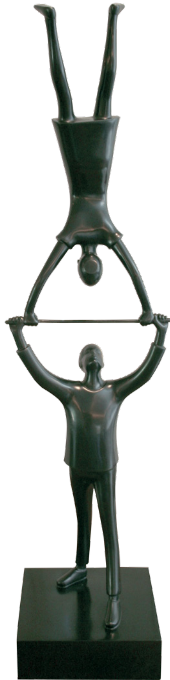
ANTON MOMBERG Collective Effort Ed. 1/15 bronze 79 x 17.5 x 17.5 cm