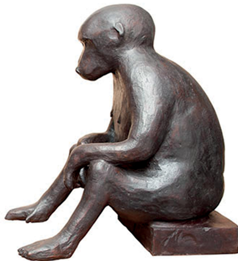
WILMA CRUISE End Game Ed. 1/10 bronze 70 x 112 x 40 cm