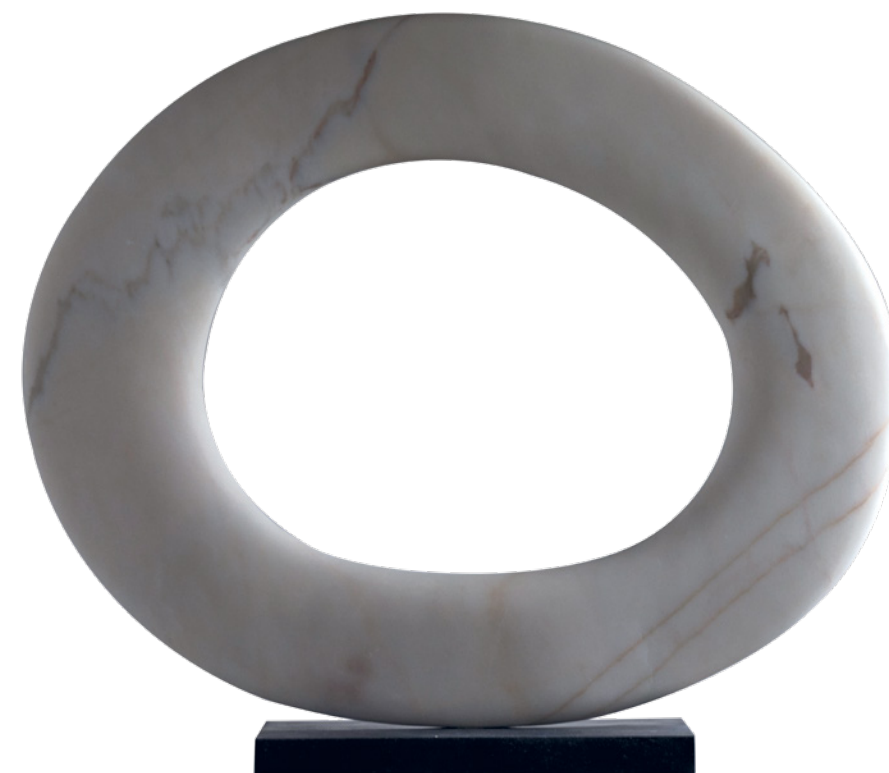
ABOVE WILLIAM PEERS Tamasan Portuguese marble 98 x 100 x 11 cm