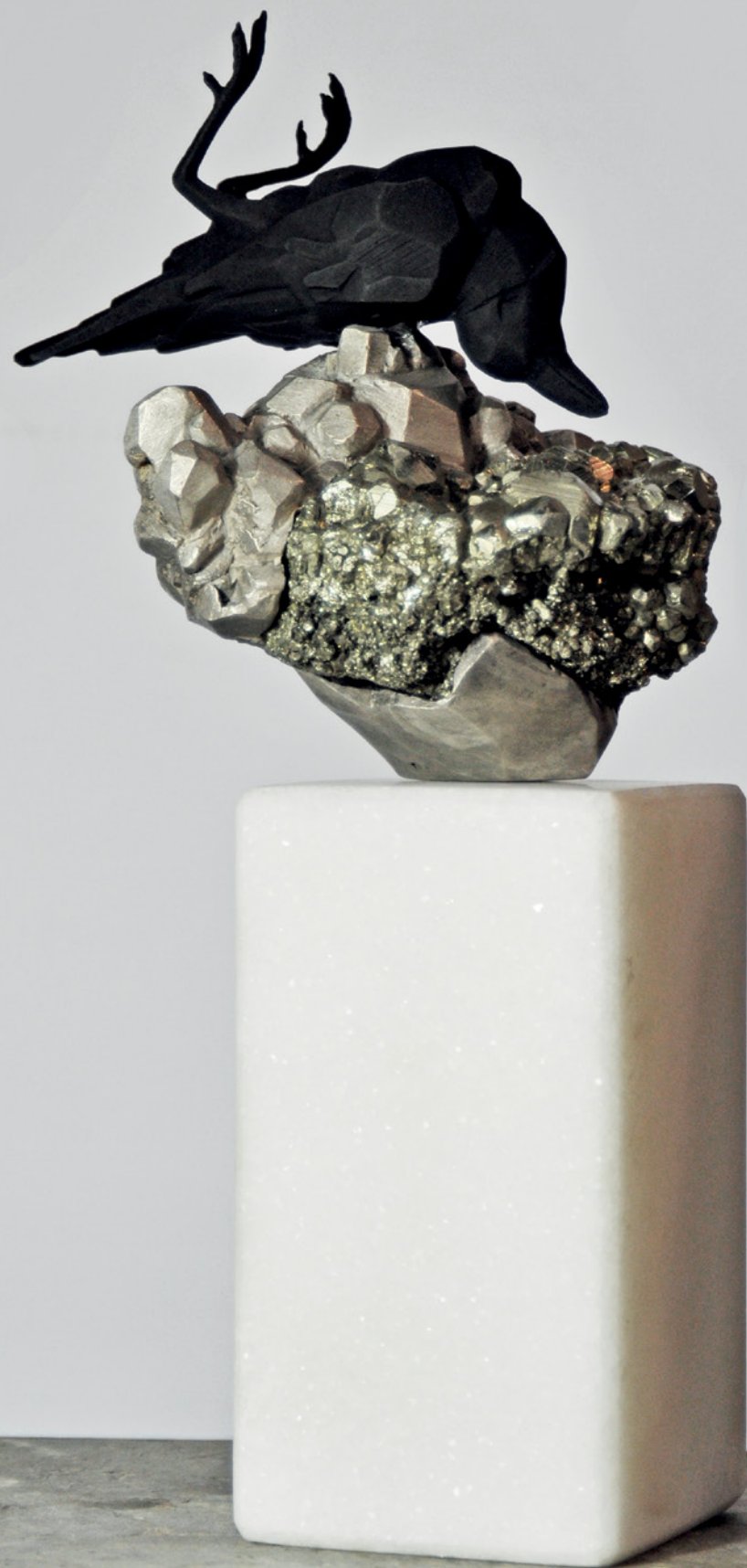
LEFT RINA STUTZER The Collector bronze, iron pyrite crystal 26 x 13 x 11 cm