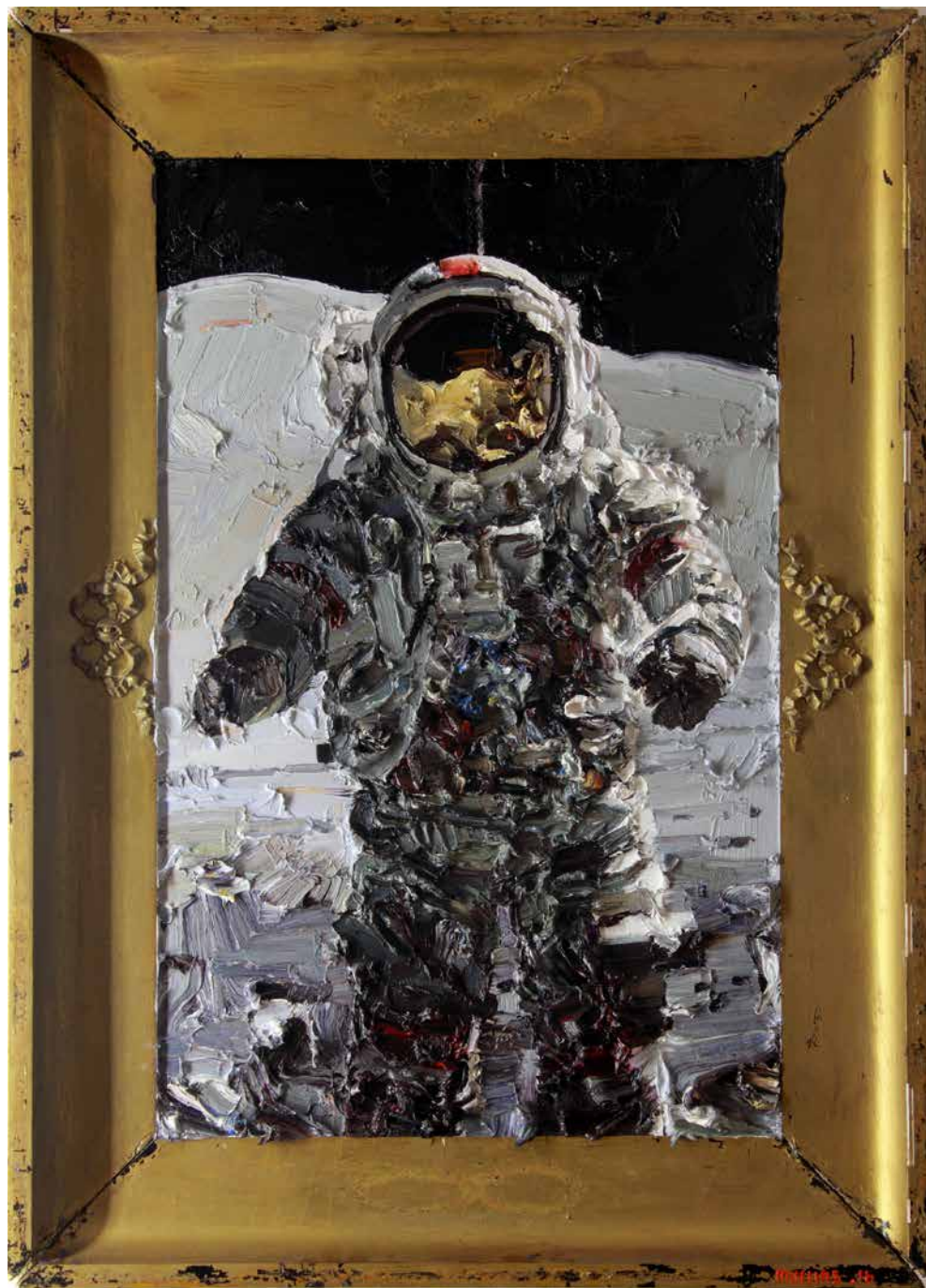
ABOVE & RIGHT (DETAIL) Talisman , 2016 oil on superwood and frame 93 x 67 cm