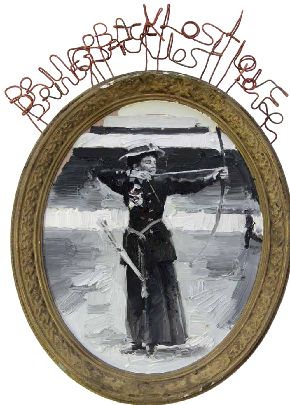
Bring Back Lost Love (London Olympics 1908), 2016 oil and copper wire on superwood 40 x 38 cm