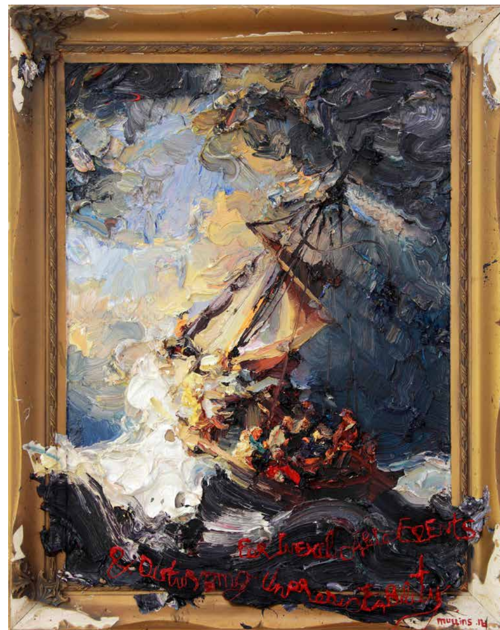
For Inexplicable & Disturbing Unpredictability, 2016 oil and wire on superwood and frame 77 x 62 cm