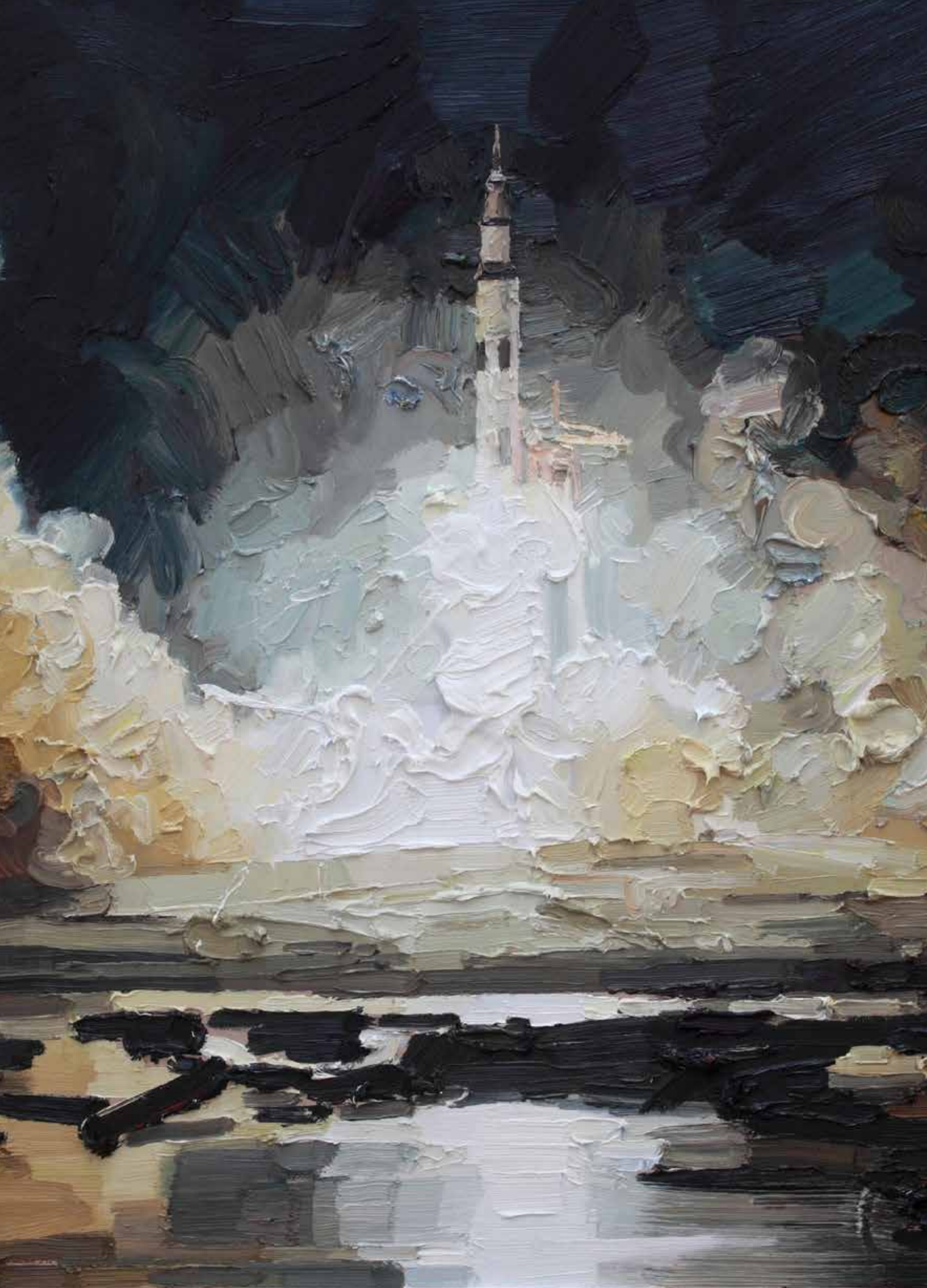
COVER (DETAIL) Touch Here for Heroic Prosperity & Unlimited Progress , 2016 oil on superwood and frame 67 x 94 cm