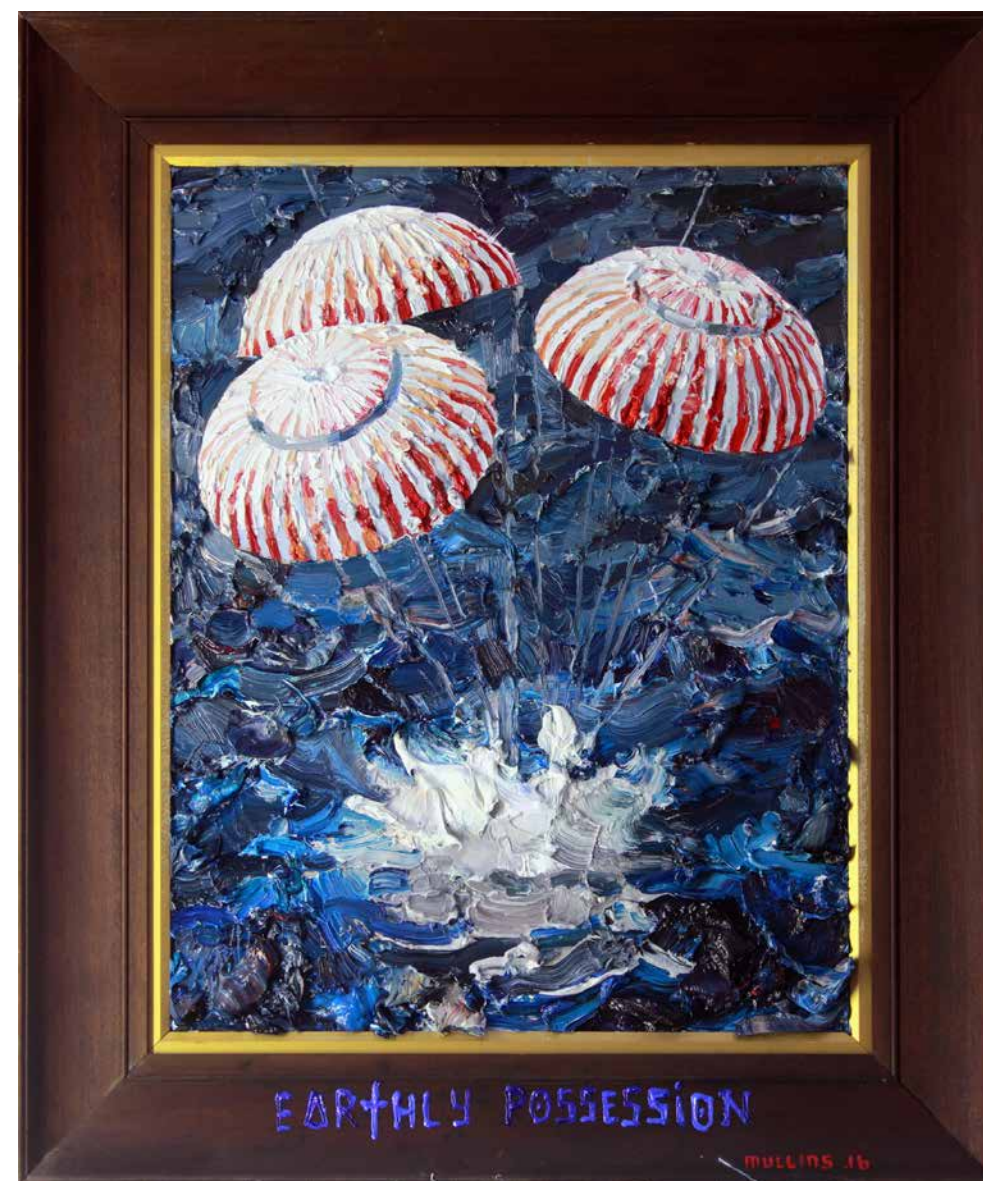
Earthly Possession , 2016 oil on superwood and frame 63 x 52 cm