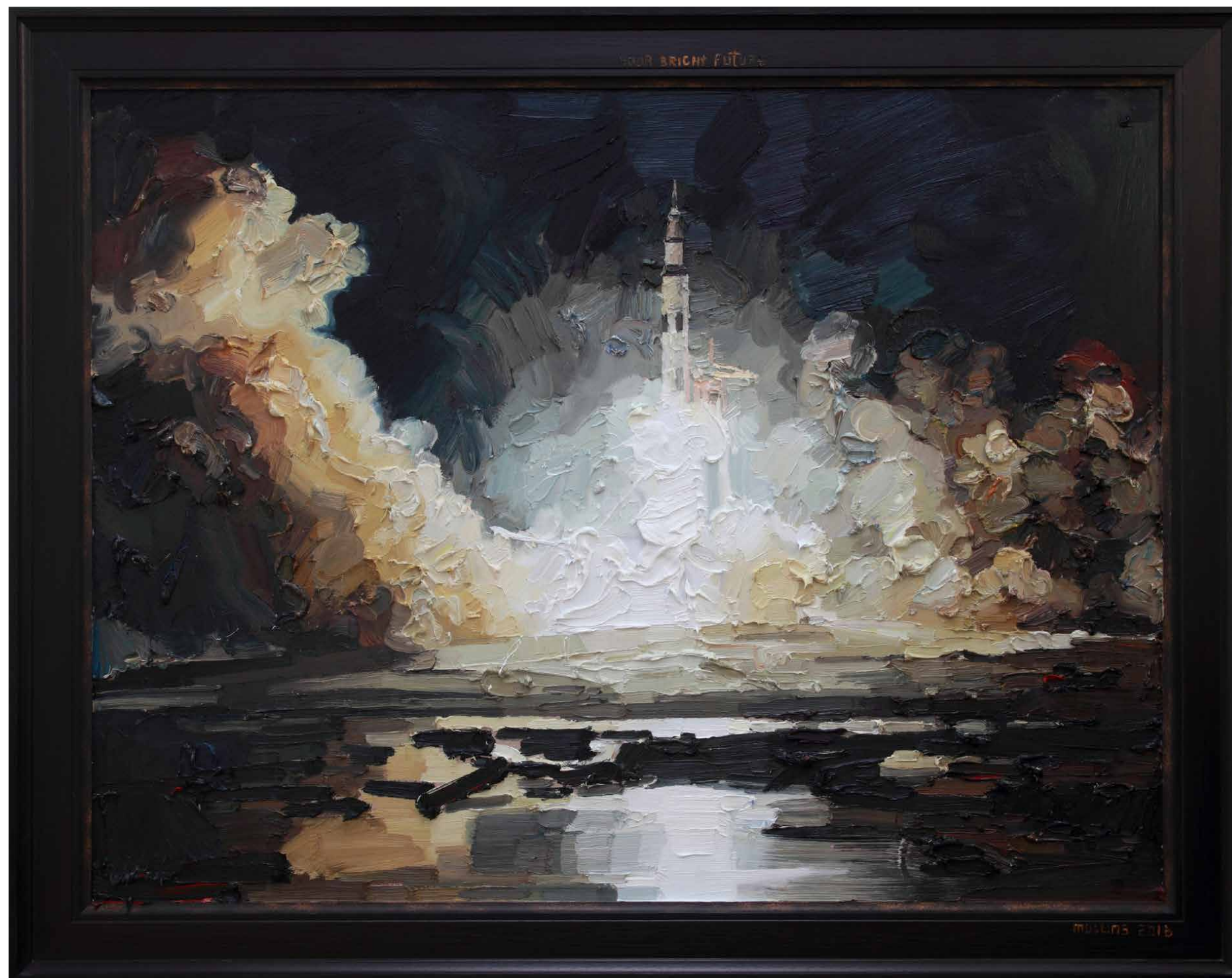
Your Bright Future , 2016 oil on superwood and frame 107 x 136 cm