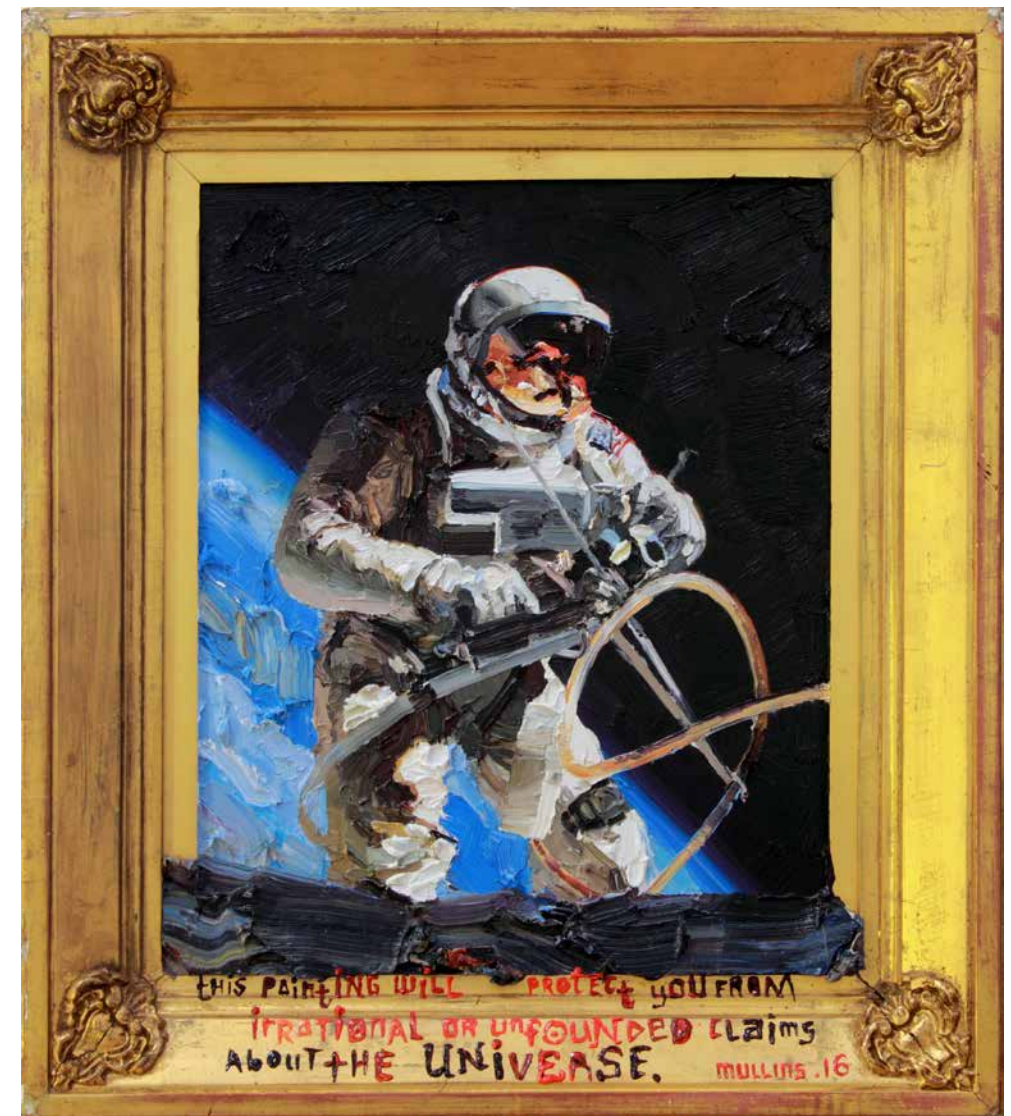
This Painting Will Protect You From Irrational Claims About The Universe , 2016 oil on superwood and frame 59 x 52 cm