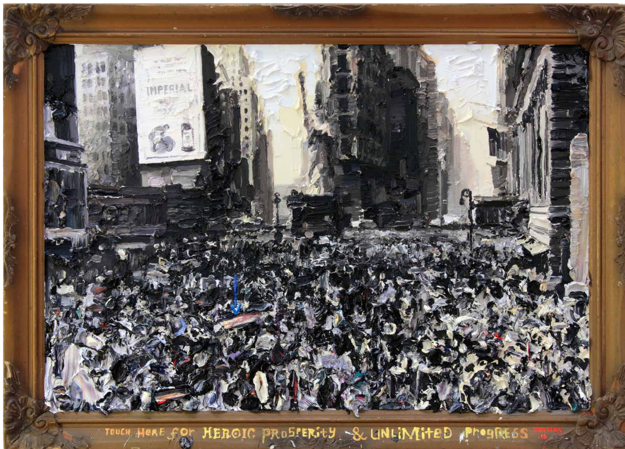
Touch Here for Heroic Prosperity & Unlimited Progress, 2016 oil on superwood and frame 67 x 94 cm