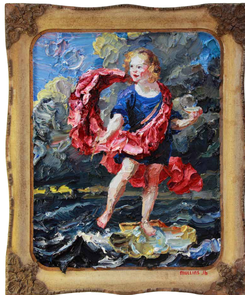
RIGHT AND PAGES 16–17 (DETAIL) After Karel Dujardin 1663, 2016 oil on superwood and frame 60 x 50 cm