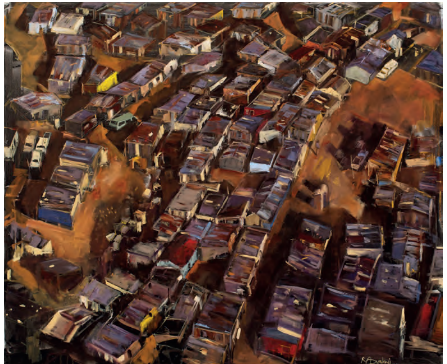
Ricky Dyaloyi Aerial View