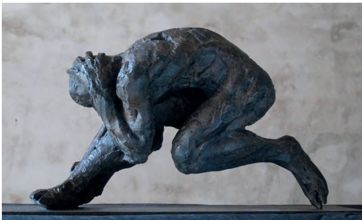
Dylan Lewis Male Trans-Figure XVI