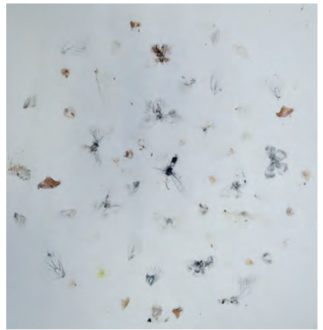
Bronwyn Lace Homage to Hirst II