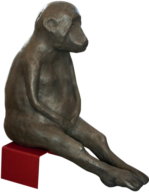
Wilma Cruise Little Baboon on Found Object