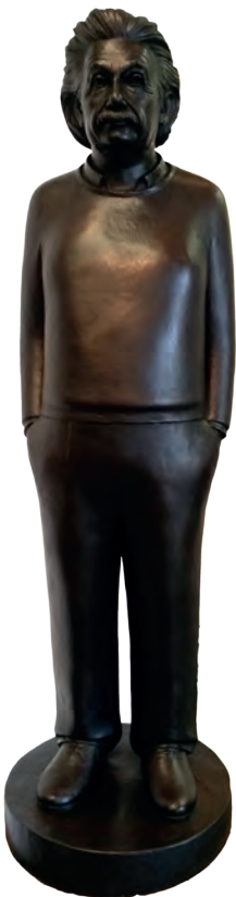
Anton Momberg Einstein