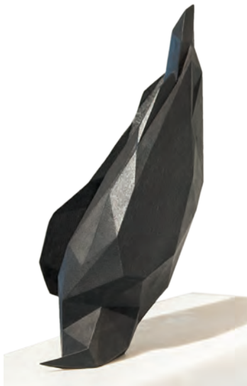
Rina Stutzer Pinned Transitory