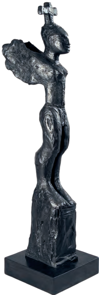
Deborah Bell Dreams of Immortality III