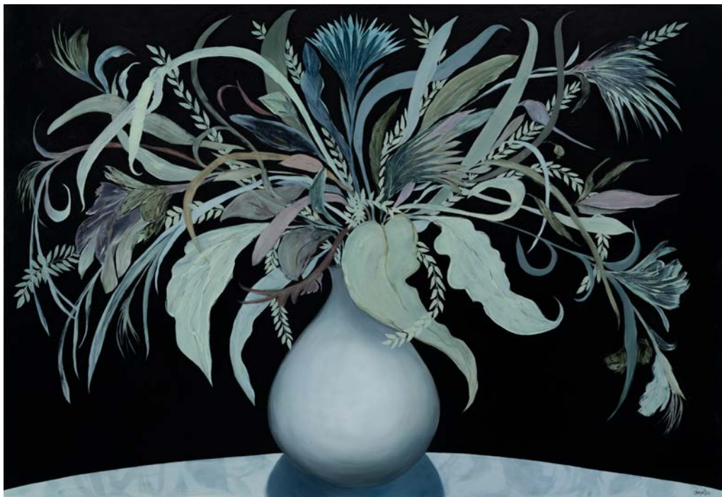
Searching for their colour oil on linen 100 x 130 cm