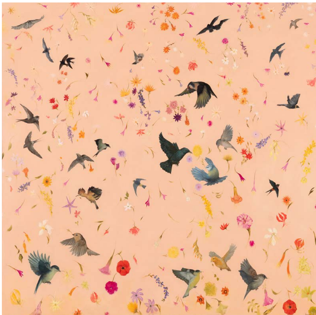
Abundance oil on linen 150 x 150 cm