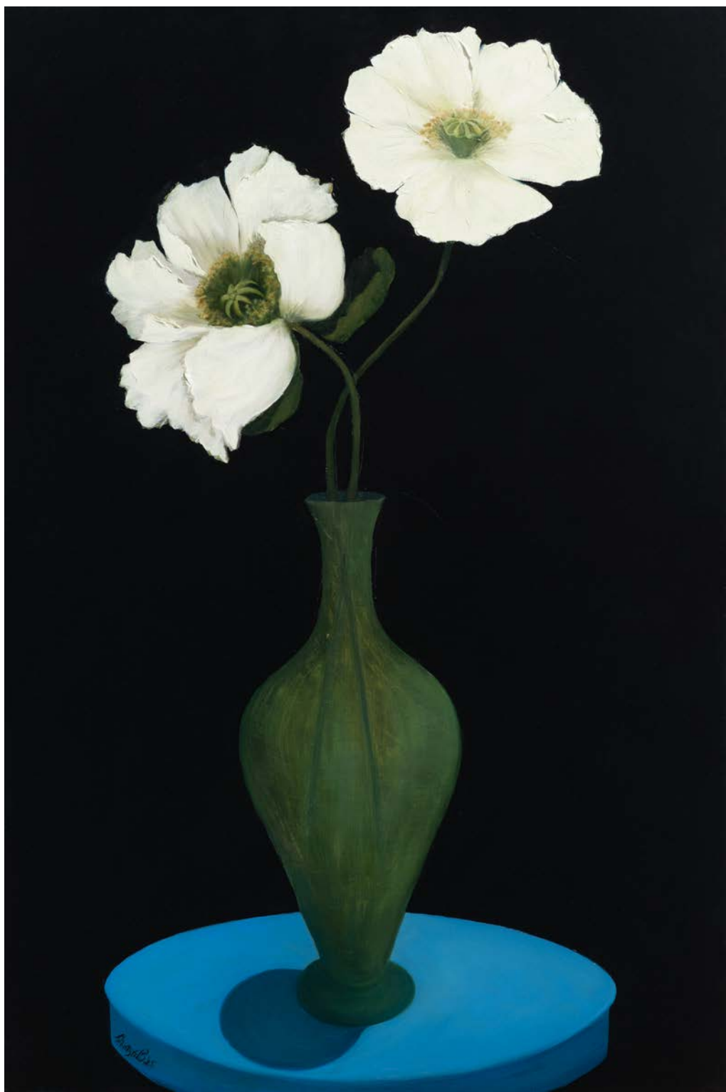
Embrace on a blue table