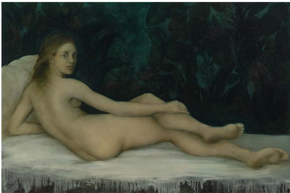
Who's there in my garden? (Female form after Ingres) oil on board 40 x 60 cm