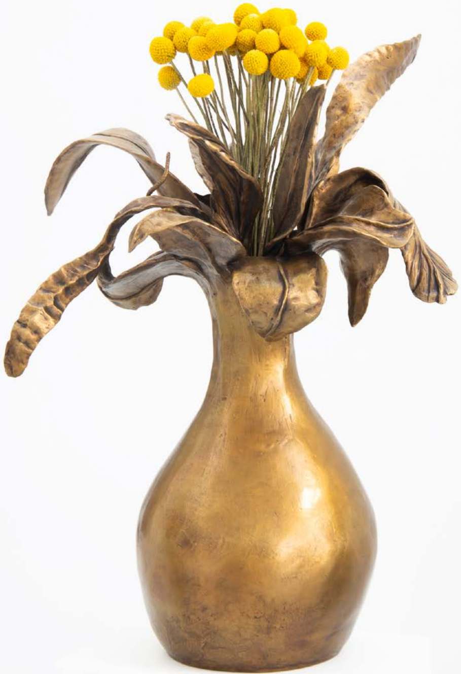
My vase het begin groei II (My vase has begun to grow II)