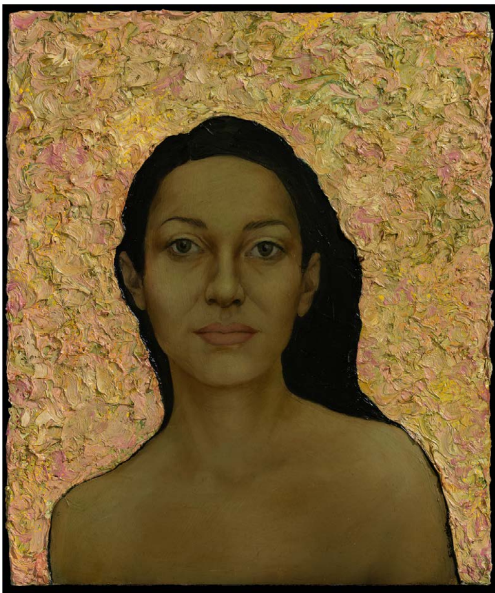
She found her place to bloom oil impasto on board 30 x 25 cm