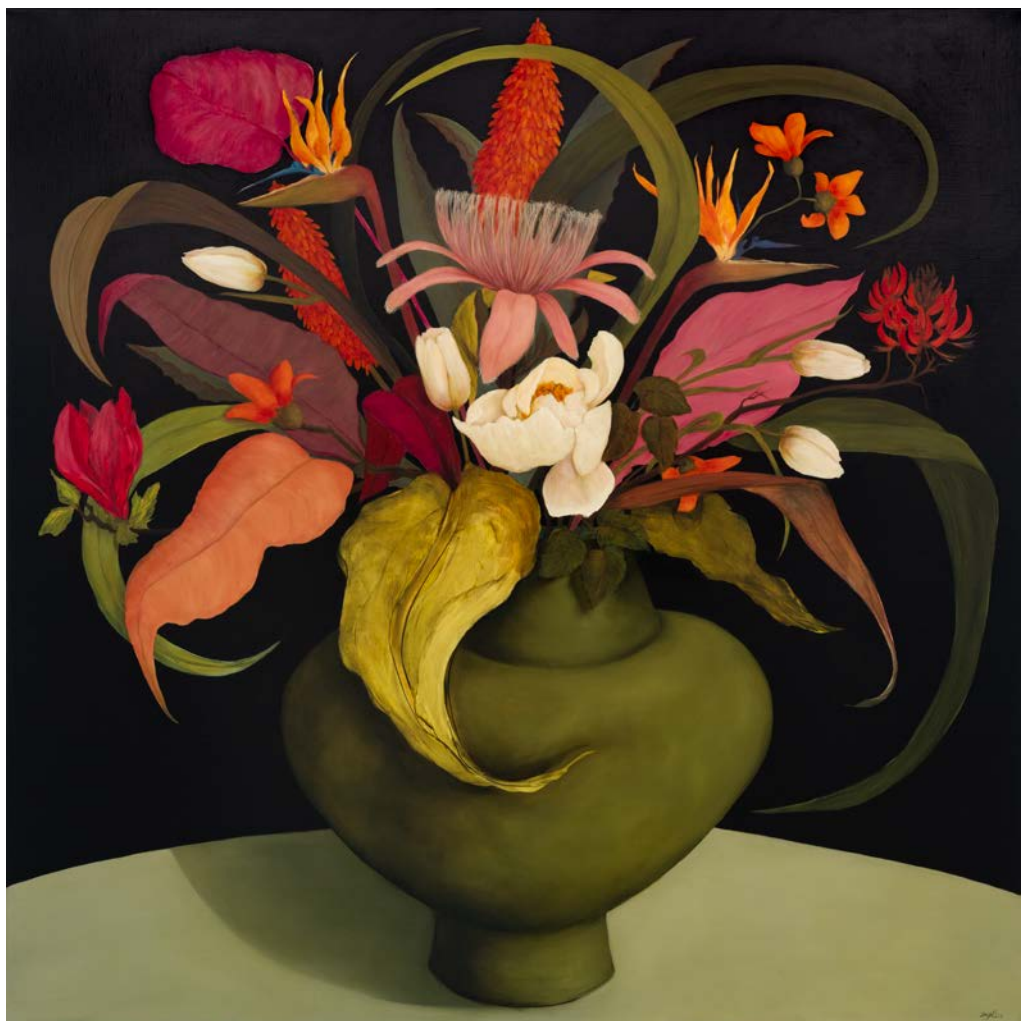
A perfect bunch from the Western Cape oil on linen 150 x 150 cm