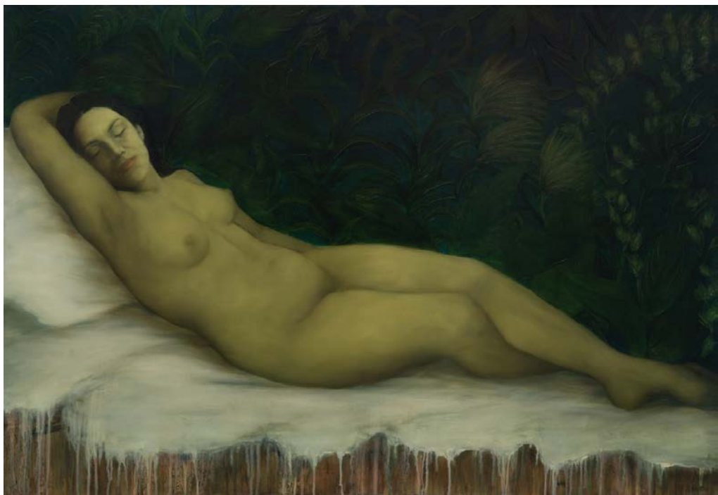
Dream garden oil on linen 100 x 130 cm