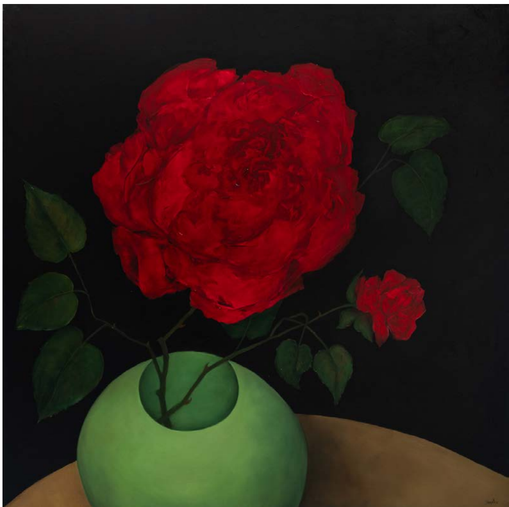
A Rose is a rose is a rose oil on linen 100 x 100 cm