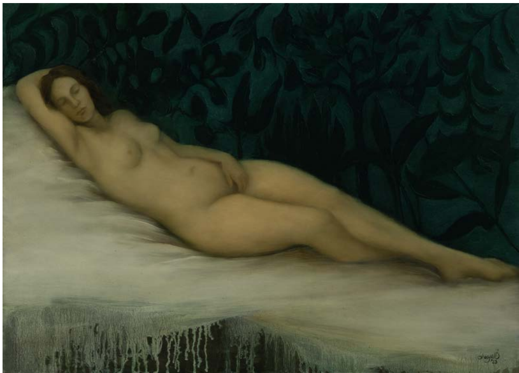
The sleeping Venus (Female form after Giorgione) oil on board 40 x 56 cm