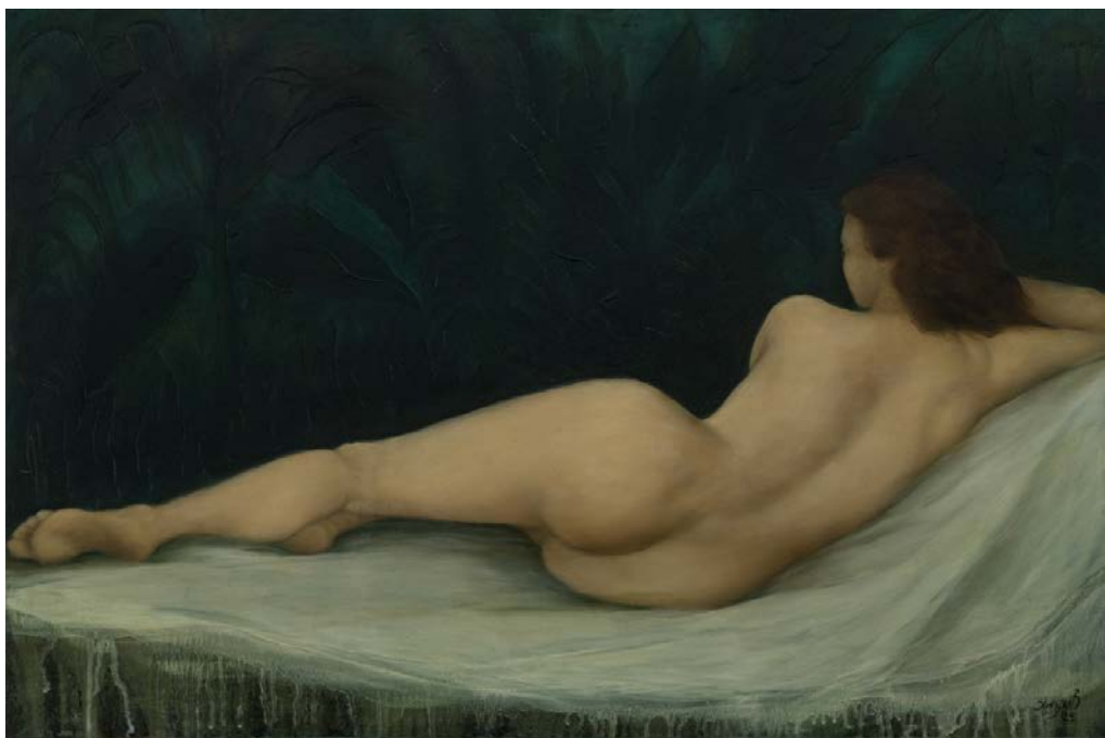
Looking through the foliage (Female form after Velazquez)