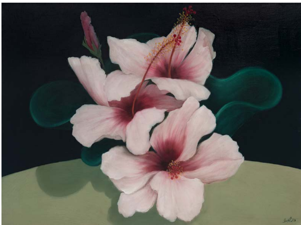
Pink hibiscus in wavy vase oil on linen 60 x 80 cm