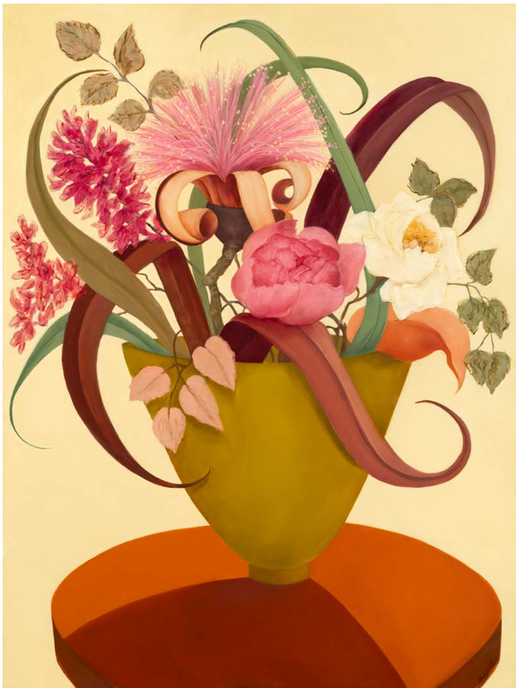
Oh! it's a sunny day oil on board 80 x 60 cm