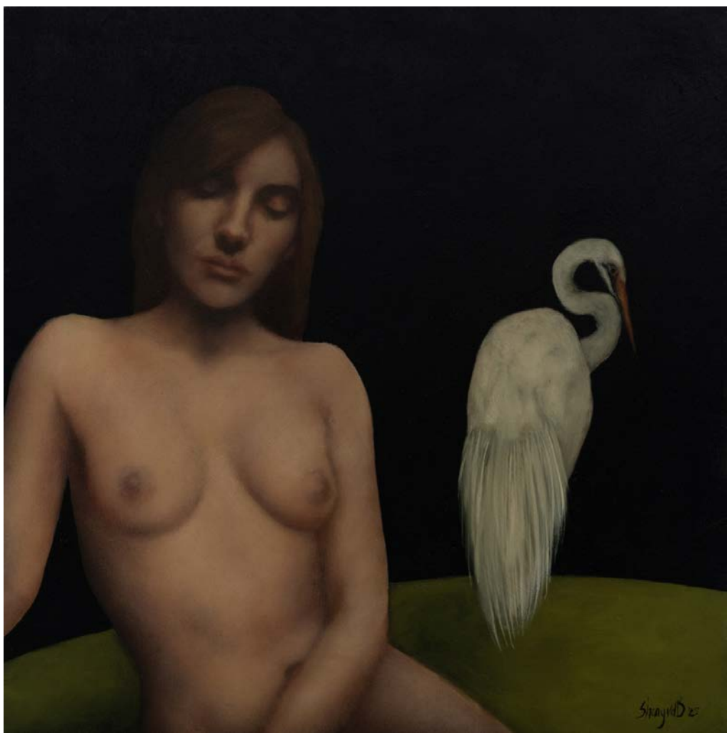
We share this space oil on board 30 x 30 cm