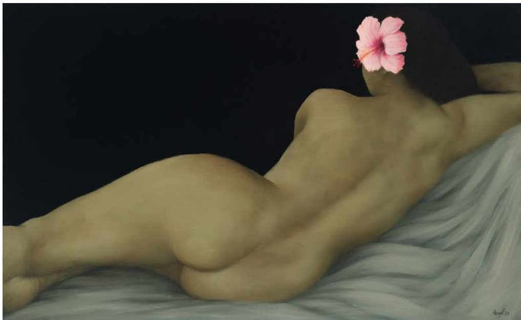
Woman with pink hibiscus oil on linen 40 x 72 cm