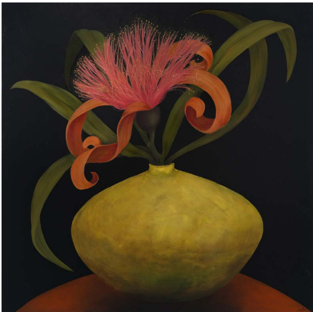
Curls and swirls in yellow vase oil on linen 100 x 100 cm