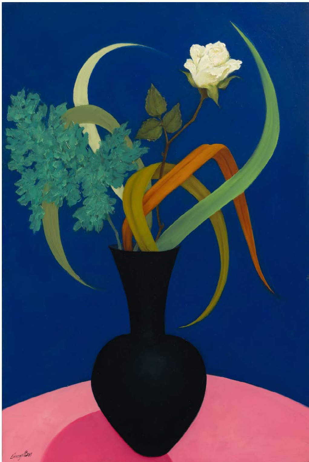
Rose's little black vase oil on board 60 x 40 cm