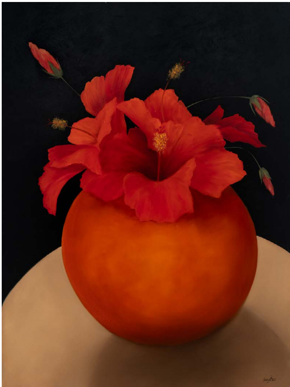
Red hibiscus in my orange vase oil on board 80 x 60 cm