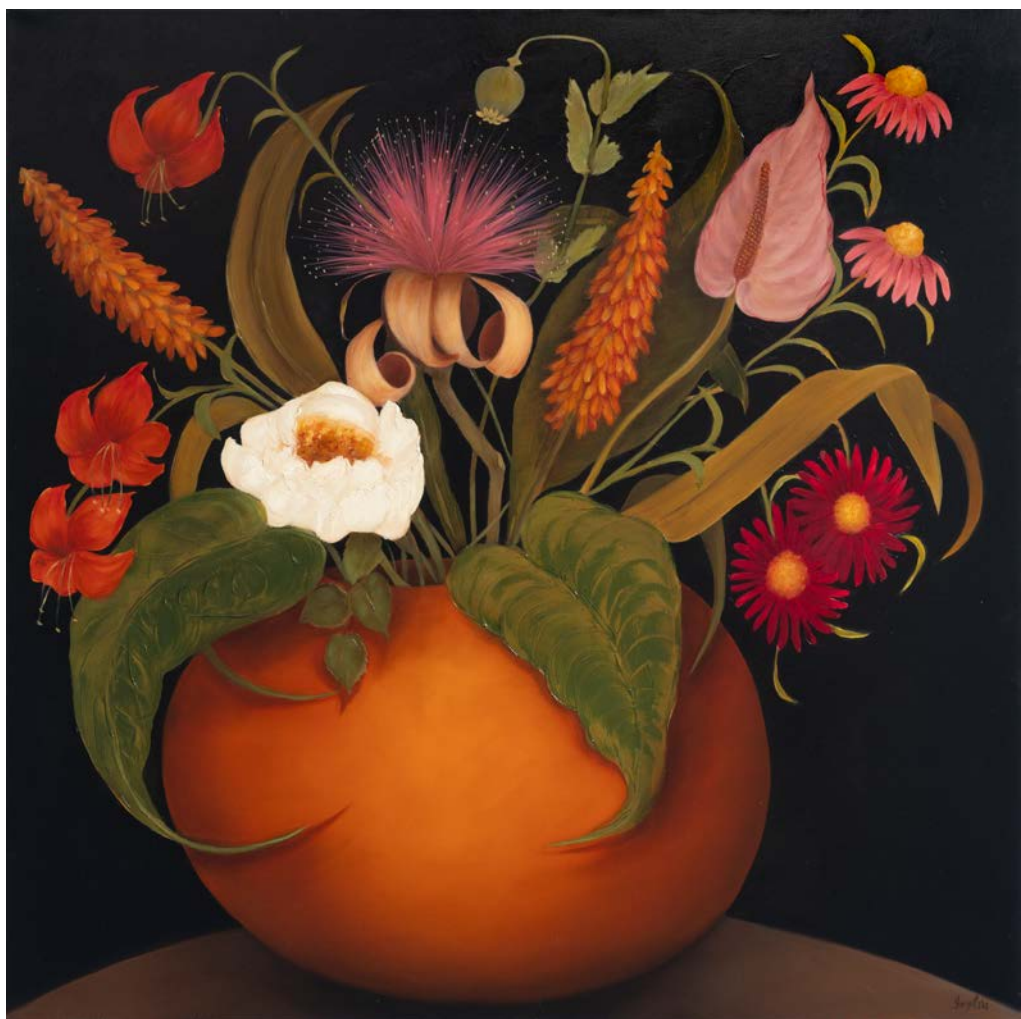
A bunch of joy oil on linen 86 x 86 cm