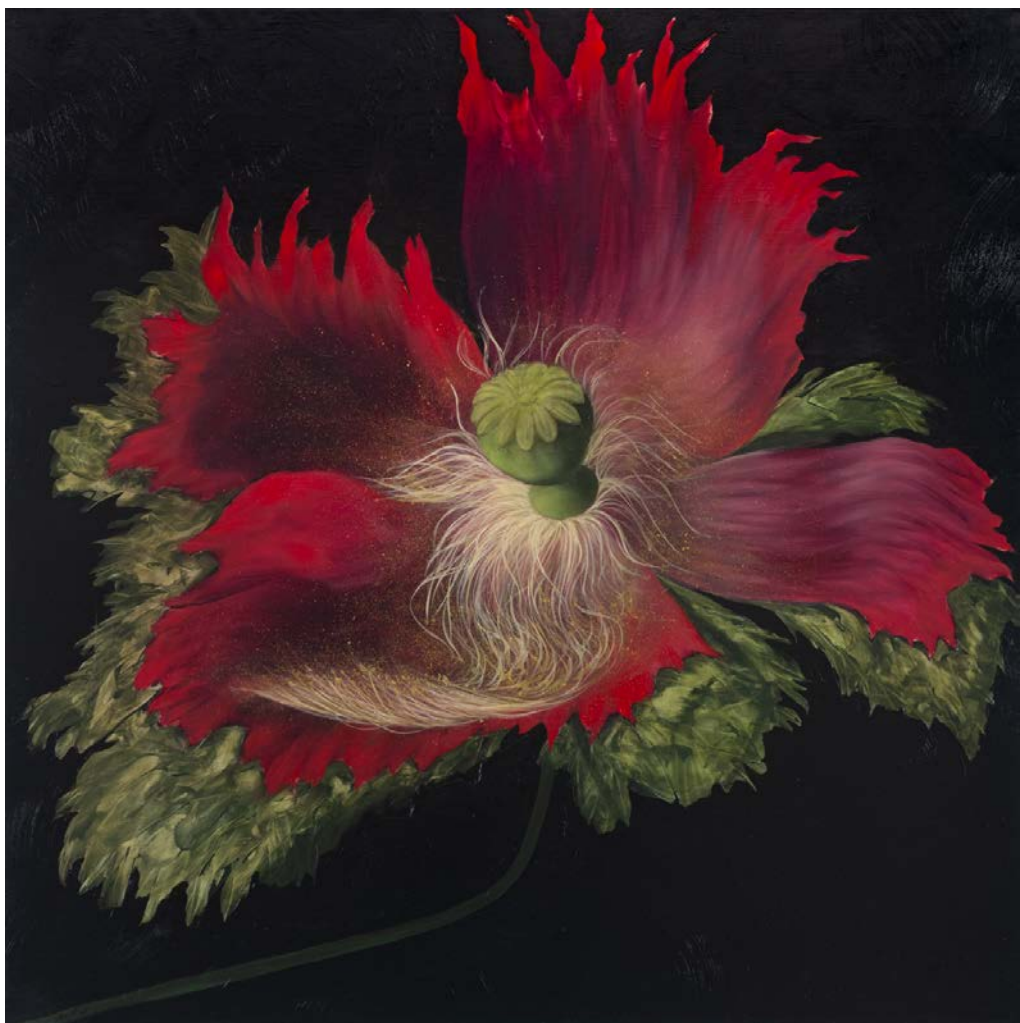
Remembrance oil on linen 100 x 100 cm